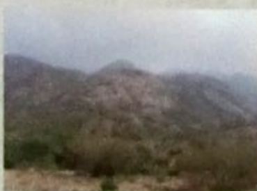
Fig. B: The foothills of Jebel Bura' are ideal leopard habitat; leopards may be re-colonizing the area