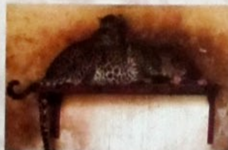
Fig. 20: December 26, 2009 - Foundation's first unofficial visit to Taiz Zoo.