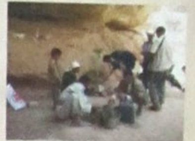
Fig. 12: June 5, 2008 - Third YLRP visit to Wada'a. Residents mix cement in order to install trail camera in Wadi Lefaj al Yemin.