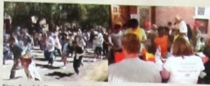
Figs. 3 and 4: November 11, 2007 - 1st Annual SIS Walk to Save the Arabian Leopard. Students raised more than US$6,000 in startup funds for the Yemeni Leopard Recovery Program (YLRP).