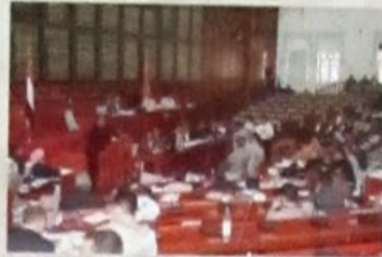
Fig. 9: April 29, 2008 - Yemen Council of Ministers declares the Arabian Leopard as Yemen's National Animal. (Stock photo)