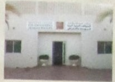
Fig. 6: February 27, 2008 - YLRP's First public speaking engagement, held at the Desert Wildlife Centre in Sharjah.