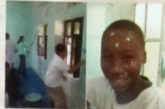
Figs. 10 and 11: May 1, 2008 - Students from the Arabian Leopard Club at Sana'a International School redecorate the Sana'a Zoo Awareness Centre.