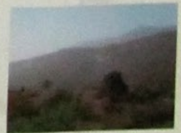
Fig. F: The proximity of Hawf Protected Area to Jebel Samhan Nature Reserve in Oman makes it an ideal candidate for a TBCA