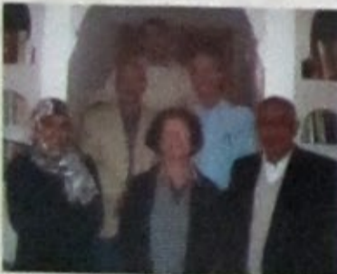
Fig. 18: November 18, 2009 - YLRP is registered with the Yemen Ministry for Social Affairs and Labor as The Foundation for the Protection of the Arabian Leopard in Yemen (FPALY).