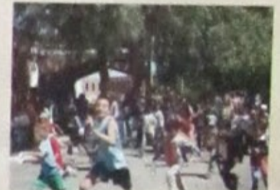
Fig. 17: November 11, 2009 - SIS students demonstrate continuing support for leopard conservation in the 3rd Annual SIS Walk to Save the Arabian Leopard.