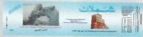
Fig. 14: August 2008 - Arwa Mineral Water Co. distributes 5,000,000 bottles of "Shamlan" mineral water with special Arabian leopard labels.