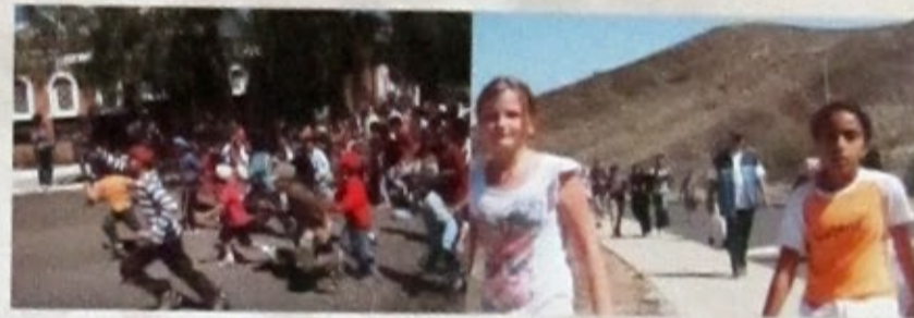
Figs. 15 and 16: November 12, 2008 - Students at Sana'a International School raise an additional $6,000 in the 2nd Annual SIS Walk to Save the Arabian Leopard.