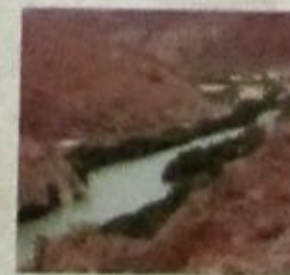
Fig. E: Wadi Masilah, Hadhramawt could harbor leopards and is in urgent need of surveying