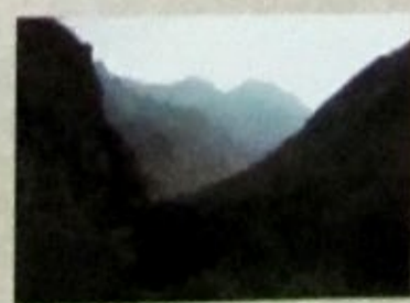
Fig. C: A camera survey is currently underway on the eastern slopes of Jebel Milhan, Mahwit