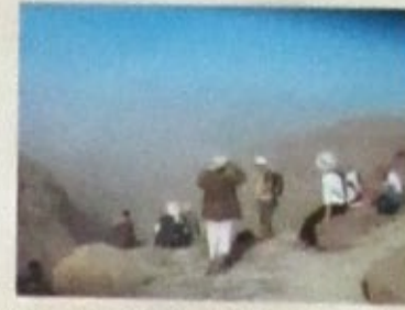
Fig. 5: February 20 to 22, 2008 - YLRP's First exploratory visit to Wada'a, Amran.