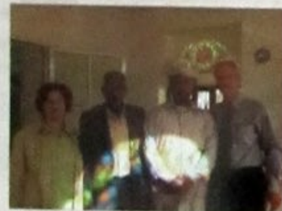
Fig. 19: December 11, 2009 Foundation's first official visit to Sana'a Zoo.