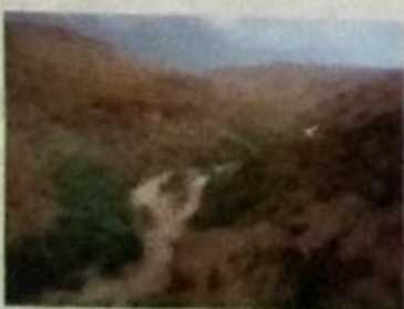
Fig. A: Wadi Lefaj Al Yemin in Wada'a, Amran has the most recent confirmed reports of Arabian leopards in Yemen

The Future - Pending the receipt of sufficient funding and following a cooperative training program conducted by staff at Jebel Samhan Nature Reserve in Dhofar, Oman, the Foundation for the Protection of the Arabian Leopard in Yemen has planned a rigorous program of leopard surveys for 2010. Some sites under consideration for surveys include: