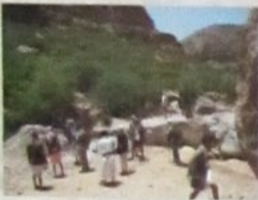
Fig. 13: June 28, 2008 - SETBACK! Trail camera is stolen from Wadi Lefaj al Yemin by detractors of the protected area.