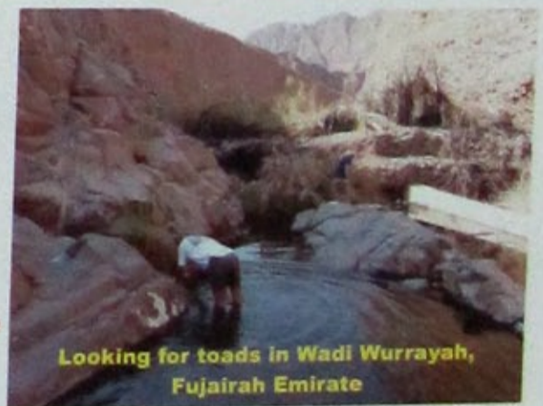
Looking for toads in Wadi Wurrayah, Fujairah Emirate